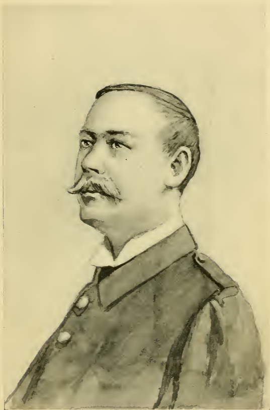
GENERAL JOSÉ TORAL